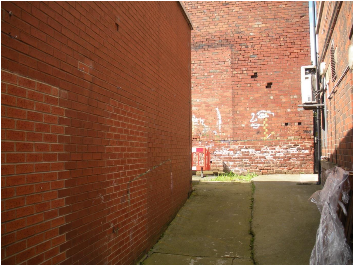
No.6. View looking from Harrison Street towards the central area of the 'Courtyard'.