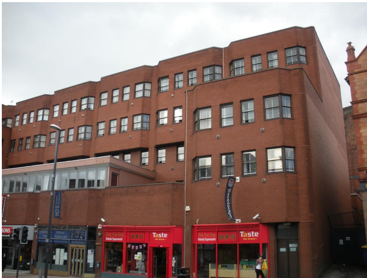
No.3. The 'Courtyard' entrance looking towards Vicar Lane.