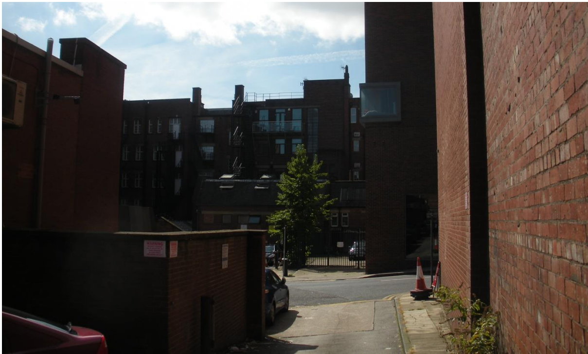
No.8. Closer view of apartments that face Harrison Street.