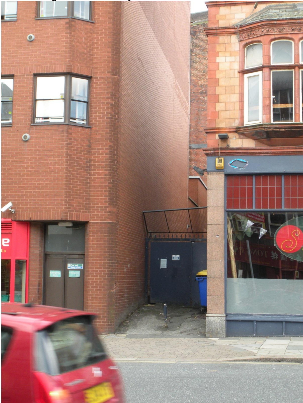
No.1. Showing entrance to 'Courtyard' from Vicar Lane.